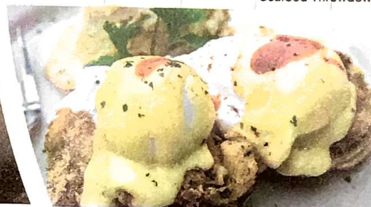
Deviled Crab Benedict